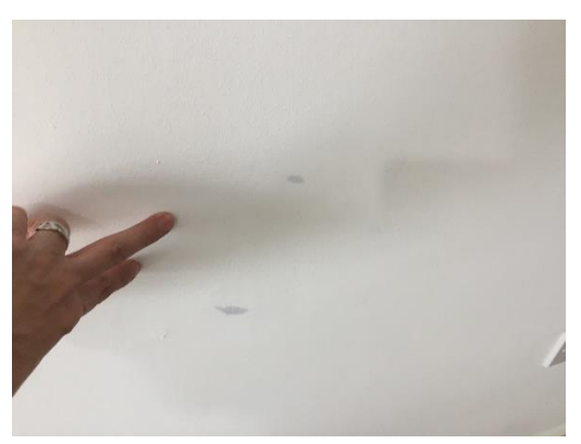
Painted over small purple marks