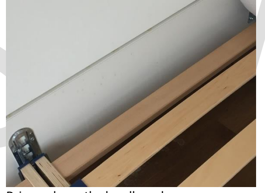
Drip marks on the headboard