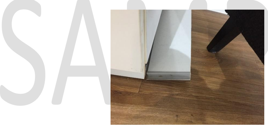
Kickboard edge panel loose