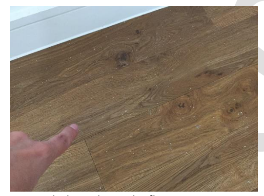
Paint splash marks on the flooring