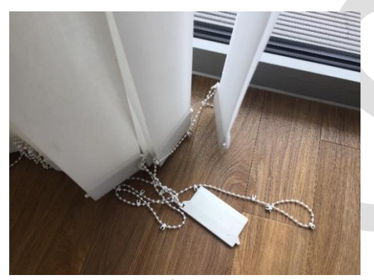
Blind slats detached from the base cable