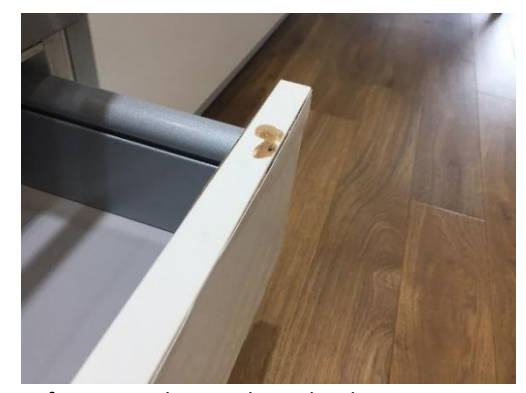
Leftover residue mark on the drawer