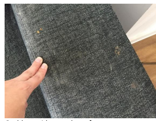
Grubby residue on the sofa armrest