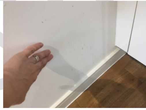
Drip marks on the wall, by the dishwasher